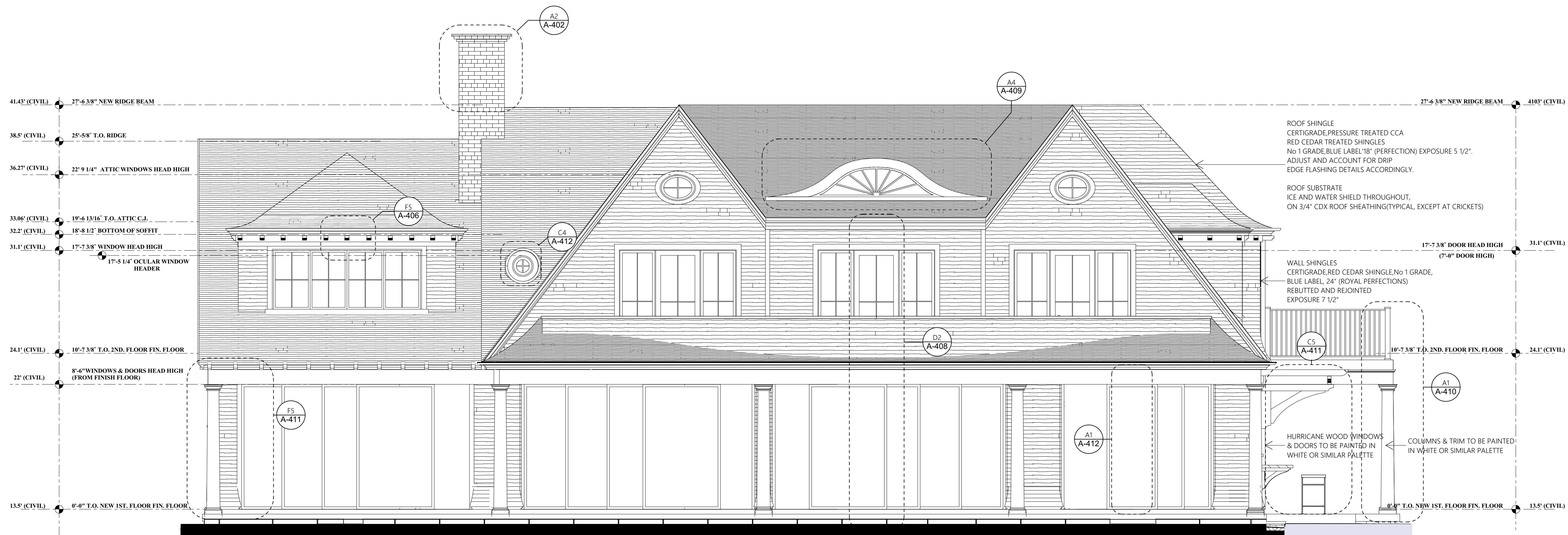
C1 WEST ELEVATION SCALE: 1/4" = 1'-0"