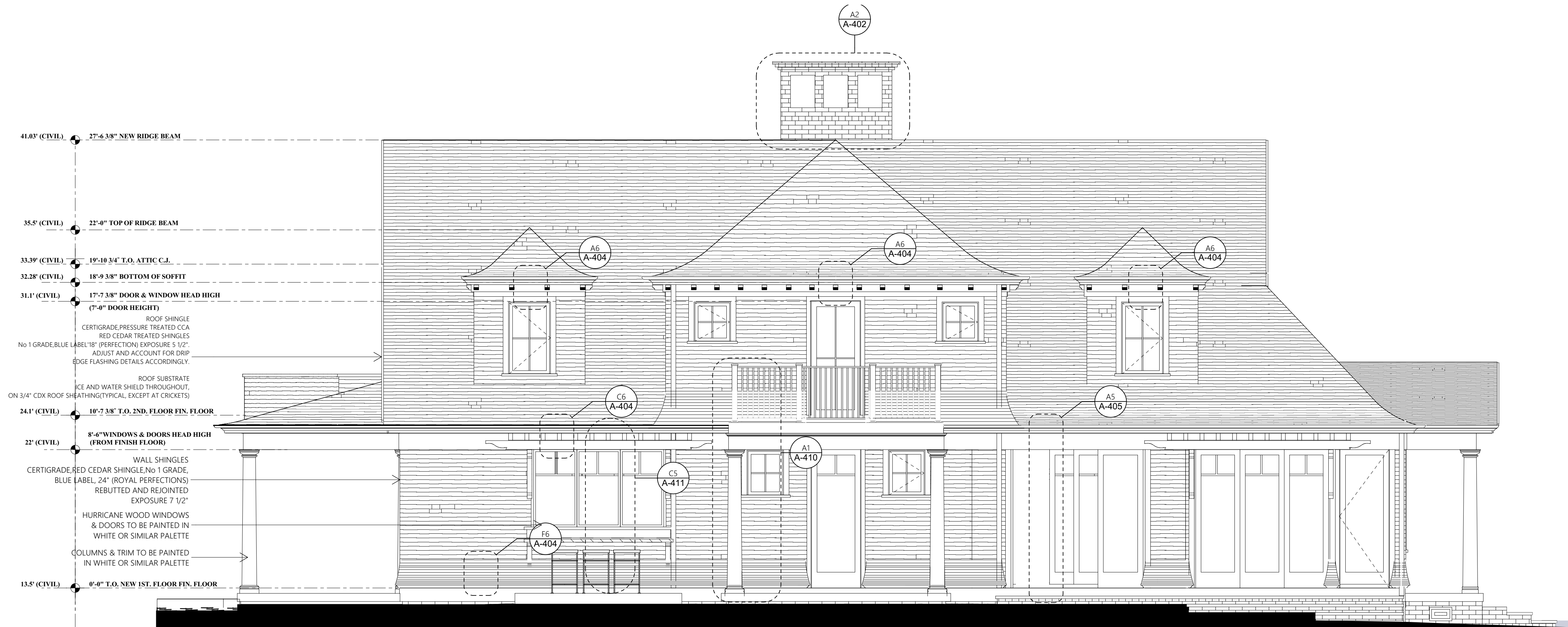
F1 SOUTH ELEVATION SCALE: 1/4" = 1'-0"